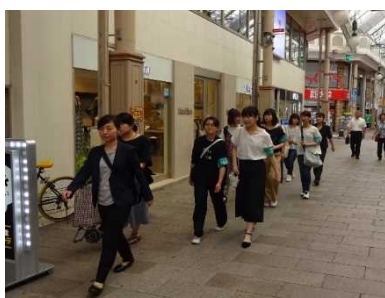
A scene of street guidance

The police, in cooperation with community juvenile police volunteers, are making every effort to detect juvenile delinquents at early stages and provide guidance in a timely manner through on-the-spot protection and street guidance activities in crime-prone areas like entertainment districts and arcades.