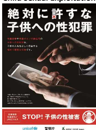
Child Sexual Exploitation Awareness Poster

Child sexual exploitation is of grave concern to the international community in light of the protection of children's rights and development of youth.