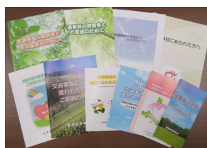
Brochure for crime victims (of traffic accidents)