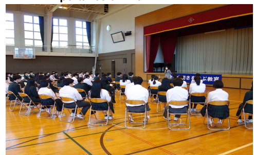
Lecture “Classes to Learn the Importance of Life”