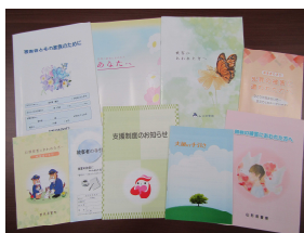
Brochure for crime victims

Lecture by a bereaved family member of crime victims: “The sentiment of remaining siblings who lost their beloved mother suddenly”