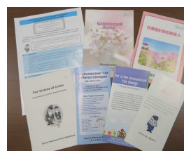
Brochure for crime victims (in foreign languages)