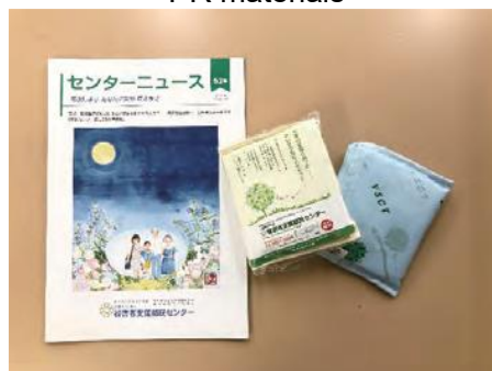
Magazine “Tokyo Center News” and PR materials

In addition, we published messages from related people by reflecting on our past activities in our magazine “Tokyo Center News,” which is published three times a year, as a special issue to commemorate the 20th anniversary of the Tokyo Center.