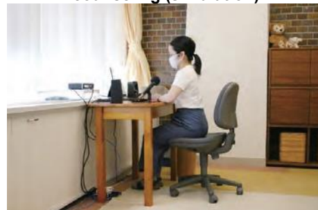
Scene from implementation of online counseling (simulation)

Currently, in the COVID-19 pandemic, online counseling has been also adopted in accordance with the situation of crime victims, etc.