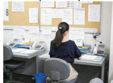
Scene from acceptance of telephone consultations (simulation)

In addition, if it is possible to provide continuous support at the Tokyo Center, they are provided with interview consultation.