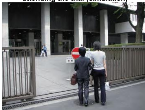
Scene from accompaniment support for attending the trial (simulation)