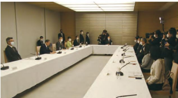
Scene from the Expert Committee