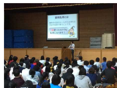
Drug Abuse Prevention Class

In addition to extensive crackdown on offenders, the police have been working with the relevant organizations to prevent expansion of cannabis abuse through educational campaigns on the hazardousness of cannabis, targeting juveniles whose cannabis abuse has been escalating.