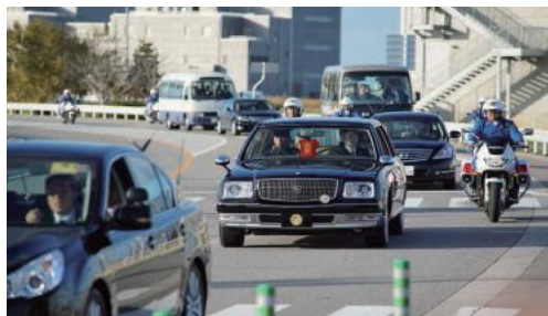
Escorting and security services associated with attendance of the Emperor at the 35th National Convention for the Development of an Abundantly Productive Sea (October, Toyama Prefecture)

In addition, under the current climate of heightened tension surrounding important officials, with concerns of possible terrorist and other illegal attacks, the police are implementing appropriate security measures to ensure their safety.