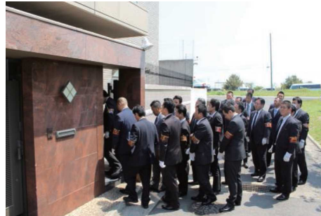
Investigation of the Kobe Yamaguchi-gumi office

to thoroughly conduct security activities to ensure the safety of the citizens’ lives.