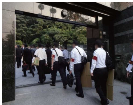
Situation at the time of investigation of the Kudo-kai office

Since September 2014, the police have arrested the president of the Kudo-kai, the chairman of the Kudo-kai and executives on charges of murder and attempted organizational murder. In addition, from November 2014 to February 2015, the Fukuoka Prefecture Public Safety Committee issued a restraint order on the use of offices of