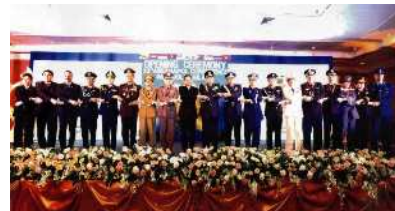
The 33 rd ASEANAPOL Conference

2013 welcomed the 40 th anniversary of the commencement of the relationship between Japan and ASEAN, and senior officers of the NPA attended the 33 rd ASEANAPOL Conference (conference of ASEAN Police Chiefs) to exchange views and strengthen cooperative ties.