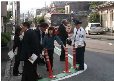
Members of Police Station Council inspecting a widened roadside pedestrian belt

When undertaking activities to prevent local crimes and traffic accidents, it is necessary to understand the views of the residents and their demands, etc. In addition, for these activities to be successful, it is essential to obtain the understanding and cooperation of local residents. Consequently, all police stations nationwide have, in principle, set up Police Station Councils. These councils allow the chiefs of police stations to hear the views of local residents regarding police station affairs, and also provide an opportunity to seek their understanding and cooperation.