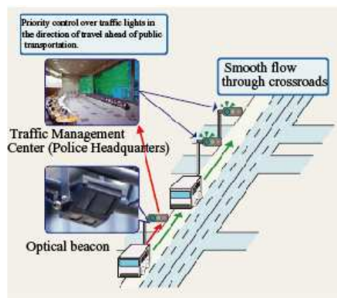
Public Transportation Priority System

In order to optimize traffic management using the latest information and communications technologies, police are promoting the development and improvement of new traffic management systems including the Public Transportation Priority System (PTPS), which controls traffic lights to give priority to buses and other mass public transportation systems by exploiting the functions of infrared beacons.