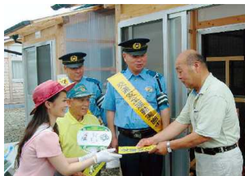
Traffic safety guidance through home visits to the elderly