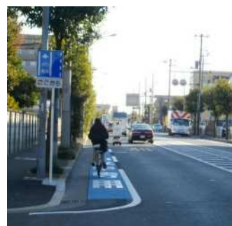
Example of a bicycle lane (Yokohama City, Kanagawa)

To enable those who comprise the bulk of traffic, pedestrians and cyclists and others, to make their journeys safely and co-exist appropriately, police are striving to secure the safety of cyclists and pedestrians by coordinating with road administrators to develop dedicated cycling spaces (bicycle lanes 4 and bicycle paths 5 ) and by undertaking reviews of areas where traffic regulations that allow “ordinary” bicycles 6 to be used on footpaths can be implemented.