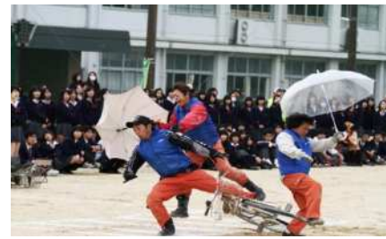
Stuntmen re-enacting an accident

Through coordination with schools and other institutions, the police are promoting bicycle safety education for children and students, endeavouring to provide enriched educational content including accident re-enactment with stuntmen and bicycle classes involving participation, hands-on experience, and practice using bicycle simulators. During 2011, about 30,000 bicycle classes were held across Japan for children, students, the elderly, etc. which were attended by about 4.4 million persons. In addition, police are endeavouring to implement education from the perspective of motor vehicle drivers, covering points for consideration in order to secure bicycle safety, etc. by making use of every driver education opportunity, such as courses during license renewal.