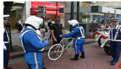
Police officers enforcing regulations regarding bicycles with faulty brakes

Focusing on priority areas and routes 7 for bicycle guidance education, police are reinforcing guidance and warning activities against violations such as riding with no lights, two persons on a single seat bicycle, ignoring traffic lights, and failing to stop at stop signs, and also taking strict steps including enforcement of regulations such as the issuance of traffic tickets against persons riding bicycles with faulty brakes (no brakes, etc.) and other malicious or dangerous traffic violations that have resulted in specific damage or injury to other vehicles or pedestrians or that have repeatedly violated the rules and ignored previous guidance and warnings.