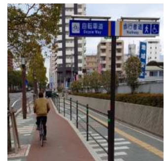
Example of a bicycle path (Kagoshima City, Kagoshima)