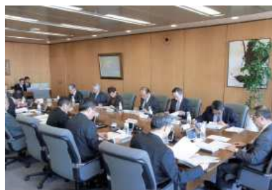
Regular meeting of the National Public Safety Commission

The Public Safety Commission System was established to ensure political neutrality and prevent dogmatic operation of the police administration and its enforcing powers with the thought that it be appropriate for a body representing the common sense of the people to manage the police. At the national level, the National Public Safety Commission (NPSC) exercises administrative supervision over the NPA, and at the prefectural level, Prefectural Public Safety Commissions (PPSC) exercise administrative supervision over prefectural police.