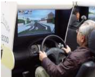
Senior driver training with driving aptitude test equipment

Police are committed to enriching education for drivers when they apply for driver's licenses and after acquiring their license. The chances for driver's education are systematically placed during the driver's license distribution process and at different stages afterwards. Police are also working to enhance measures for elderly drivers by having them complete pre-training exams (cognitive testing) and basing senior driver training on the results.