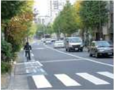
Example Bicycle Lane