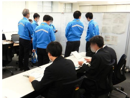
Joint training to deter cyberattacks

In order to ensure the safe and smooth transportation of people involved in the Games, while maintaining the stability of urban activities, the police took traffic management measures in collaboration with associated organizations, including restrictions on open lanes at highway tollgates.