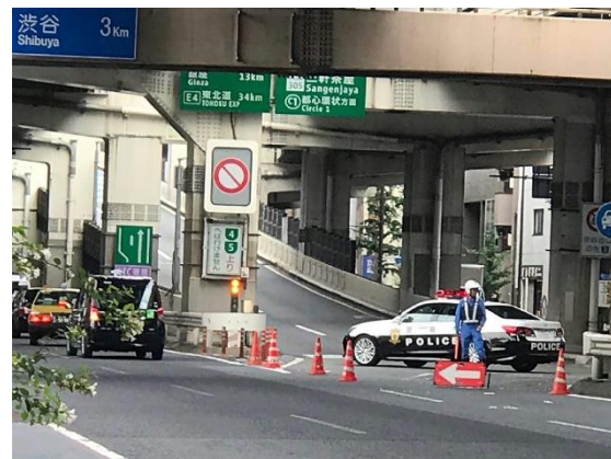
Test for closing highway entrances (Sangenjaya Entrance, Metropolitan Expressway. July 2019)