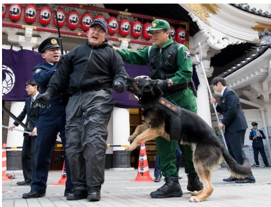
Sign indicating standard bicycles are allowed on sidewalks

The police worked to prepare for diverse issues in collaboration with the relevant ministries. The police also conducted joint training with associated organizations and private sectors to reinforce their counterterrorism operations, promoting the collection and analysis of information on cyberattacks and attackers targeting the Tokyo 2020 Games, and conducted joint training to defend against cyberattacks that might have occurred during the period of the event.