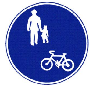
Sign indicating standard bicycles are allowed on sidewalks

As a type of vehicle, bicycles must obey the traffic signals, and must stop before a stop line when there is a stop sign.