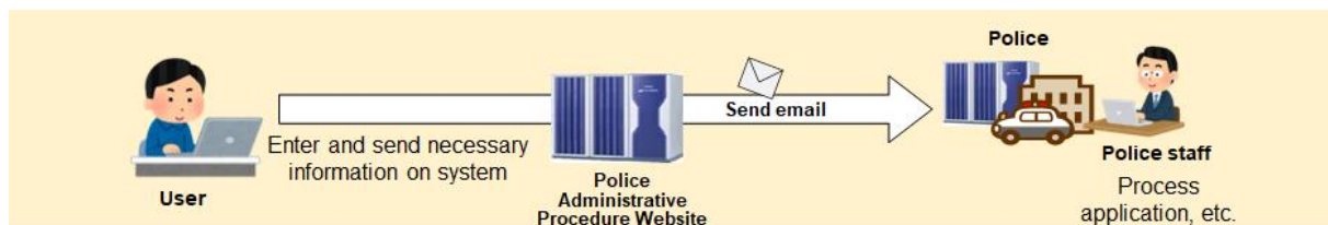
Application flow for Police Administrative Procedure Website (Example)