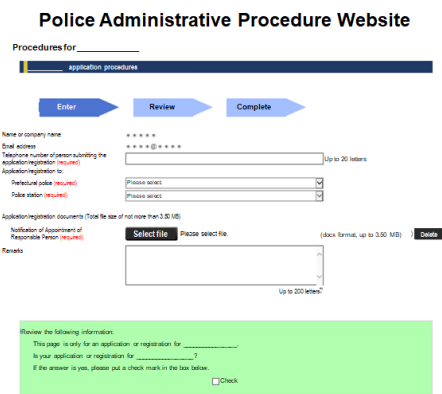
Input screen of Police Administrative Procedure Site (image)

Meanwhile, the NPA is developing a new system which shall enable the completion of more procedures online. In order to develop a system to provide usability to people, the NPA is also reviewing the procedures themselves by eliminating unnecessary attachments.