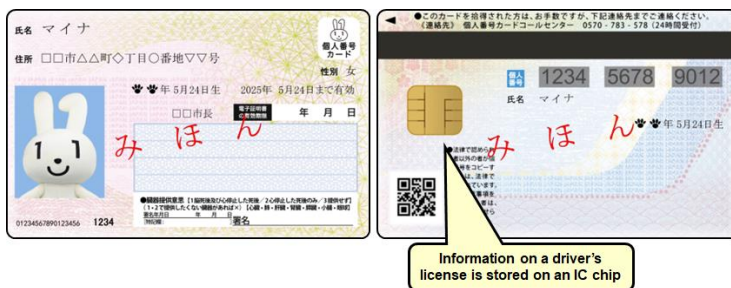
Integration of driving license and Individual Number Card (Example)

The NPA is considering the integration of driving licenses and Individual Number Cards, which will start from the end of FY2024. Due to this integration, the driving license procedures will become convenient for people, providing them with a “one-stop shop” where they can change their address, promptly renew their driving licenses outside of their place of residence, and access online training for the renewal of driving licenses.