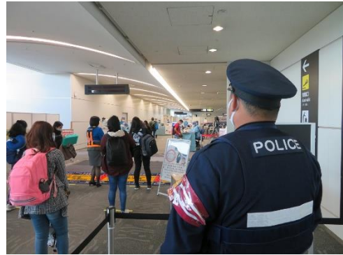
Vigilance activities at airport

Related prefectural police forces have been cooperating for the smooth implementation of quarantine, while conducting vigilance and security activities at points of entry such as airports to prevent problems and prepare for contingencies.