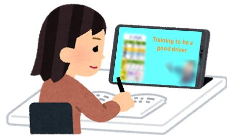
Online training (Example)