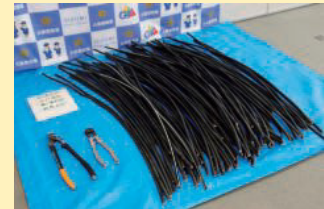
Tools used in metal theft and stolen items

The Act provides that prefectural police headquarters chiefs and other relevant officials shall endeavor to disseminate theft prevention information concerning certain products manufactured using metals for which theft prevention is considered particularly necessary to people installing solar power generation facilities and other relevant parties, and establishes necessary regulatory provisions.