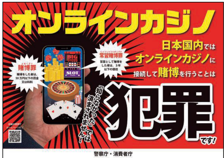
Public awareness materials on the illegality of online casinos

In 2024, the police carried out enforcement actions in 62 online gambling cases (Note 2) and arrested 279 individuals, representing year-on-year increases of 49 cases (376.9%) and 172 individuals (160.7%). Of these, “non-store-based” cases accounted for 55 cases and 227 individuals, representing increases of 50 cases (1,000.0%) and 195 individuals (609.4%).