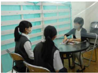
A scene of juvenile counseling

The Young Telephone Corner is a service provided by the police that offers counseling for juveniles. It is staffed by experienced juvenile guidance officials and counseling specialists, who provide necessary advice and guidance to troubled juveniles. In 2020, the police handled 74,695 juvenile consultation cases.