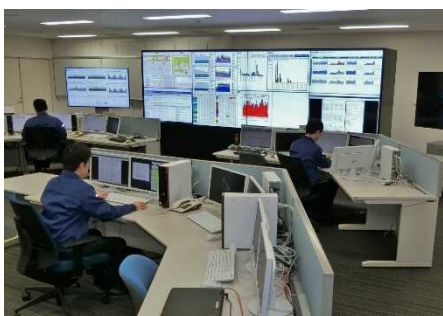
24/7 Monitoring of Malicious Network Activities

As one of the countermeasures against cyber terrorism, the Cyber Forces which are composed of mobile technical squads were organized within the NPA and Regional Police Bureaus (RPBs) in April 2001, and in the Prefectural Info-Communications Departments in May 2013. Together with PPHs, they build relationships with critical infrastructure industries by sharing the information security trends or by responding to incidents in emergencies. Additionally, in order to prevent damage due to cyber espionage activities and to investigate incidents, the Cyber Force Center (CFC) of the NPA, the head of the Cyber Forces, collects and analyzes malware attached to spear-phishing emails and provides analysis to companies with advanced technologies.