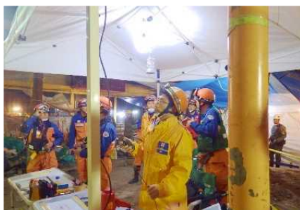
International Mobile Police Communications Squad

The NPA organizes the International Mobile Police Communications Squad to secure police communications at overseas disaster sites. In 2017, it was dispatched to an earthquake-stricken area in Mexico, as part of the Japan Disaster Relief Team.