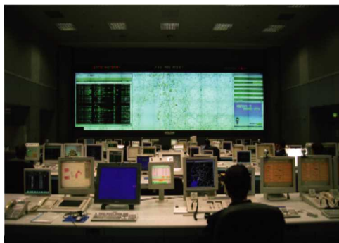
Communication Command Center

Each PPH runs its own Communications Command Center. In response to "Dial 110" calls from citizens, the center swiftly issues dispatch orders to patrol cars and police officers on duty using radio, police telephones and mobile data terminals.