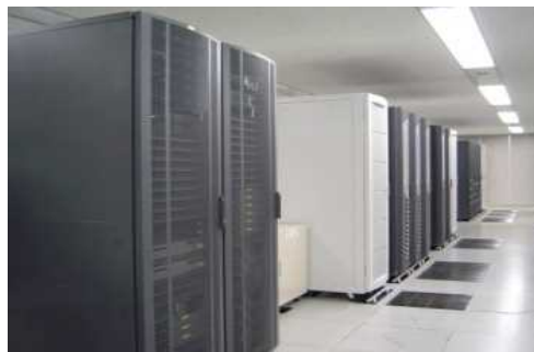
Information Processing Center

The Criminal Information Management System stocks a variety of information such as on stolen vehicles and missing persons. Police officers on the street can immediately obtain necessary information through this system.