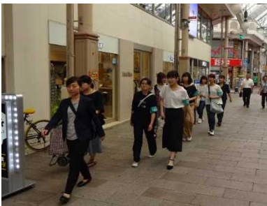
A scene of street guidance activities

The police, in cooperation with community juvenile police volunteers, are making every effort to detect juvenile delinquents at early stages and provide guidance in a timely manner through on-the-spot protection and street guidance activities in crime-prone areas like entertainment districts and arcades.