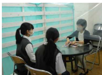
A scene of juvenile counseling

The Young Telephone Corner is a service provided by the police that offers counseling for juveniles. It is staffed by experienced juvenile guidance officials and counseling specialists, who provide necessary advice and guidance to troubled juveniles. In 2020, the police handled 74,695 juvenile consultation cases.