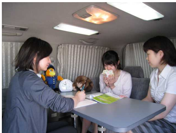
Special vehicle for supporting crime victims

Crime victims and their families not only suffer physical, emotional, or financial harms as direct results of the crimes, but also undergo a wide range of harms through secondary victimization. Police officers receive training on treatment of victims to reduce their burden. Police stations have rooms that are furnished, lighted, and decorated where victims can consult with police officers in a relaxing atmosphere. The police also provide many other support services for victims including accompaniment to hospitals or to courts upon request.