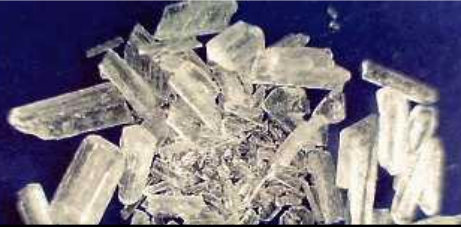
Stimulants Methamphetamine Amphetamine

*Use of cannabis in Japan, and the export of New Psychoactive Substance (NPS) from Japan are not prohibited by the current laws.