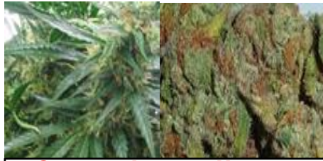
Cannabis, marijuana, hemp