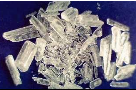
Stimulants Methamphetamine Amphetamine

For example, the person who possessed / imported below illegal drugs is to be punished.