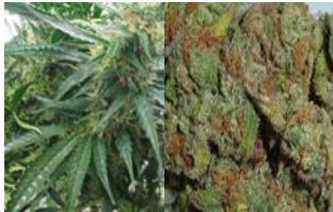
Cannabis, marijuana, hemp