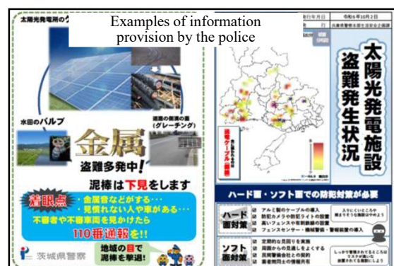
Examples of information provision by the police