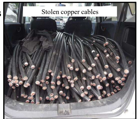
Stolen copper cables

※*These are scrap metals comprised of specified metals (copper and other metals specified by Cabinet Order) that are used in manufactured products for which the prevention of theft is a high priority