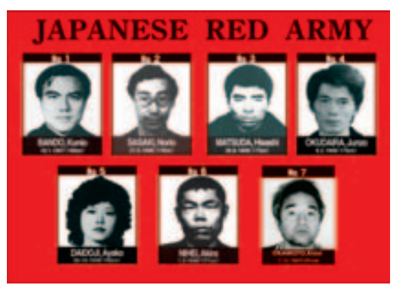
The JRA members currently placed on the international wanted list by Japan

With the arrest of Fusako Shigenobu, the JRA is now placing the restructuring of its organization and the construction of new activity bases as its top priorities. Therefore, the prospect of its members to resume terrorist activities is low at this point relatively speaking. Nevertheless, its nature as a terrorist organization is unchanged, and therefore the danger remains. The police are engaging in efforts for the early discovery and arrest of the seven JRA fugitives, as well as striving to contain their activities.