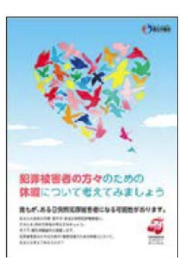
Poster to promote the Leave System for Victim's Recovery