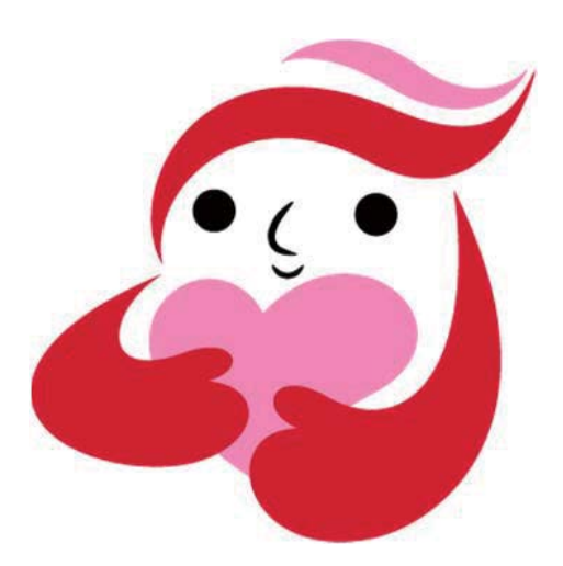
The crime victim support symbol mark Gyutto-chan (holding a victim tight)

In 2004, the Ministry of Health, Labour and Welfare is conducting intensive advocacy activities during November as the Month to Promote Prevention of Child Abuse to deepen the understanding and to raise awareness of every parts of the society on child abuse in collaboration with related ministries and agencies, local governments, and related organizations. In fiscal year 2014, the Ministry of Health, Labour and Welfare adopted a monthly slogan, "Don't hesitate. Let us know and be connected in the circle of life", held a National Forum on Child Abuse Prevention in Wakayama City (November 24), prepared and distributed posters, leaflets, and handbooks that introduce the Child Guidance Centers' nation-wide common hotline, and thus, through Government PR media and various media (radio and Internet TV, etc.), propagated the principle that child abuse is an issue to be resolved by society as a whole.