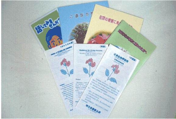
Resource: the National Police Agency