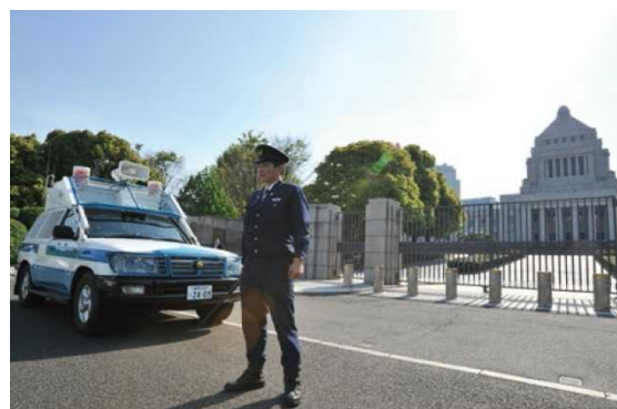
Security at the Diet Building

With the recent difficult situation caused by international terrorism in mind, the police are boosting their vigilance and security activities for important facilities, including the office of the Prime Minister, airports, nuclear facilities, and facilities related to the U.S. and for public transportation such as railways.