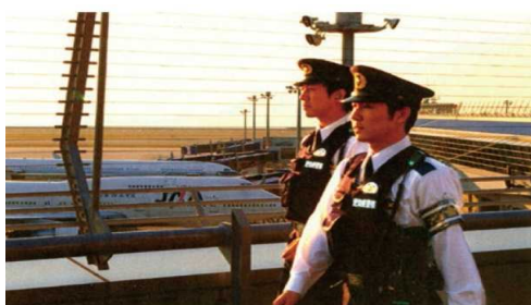
Security at airports

As Japan will be hosting large-scale events in the near future, the police are promoting