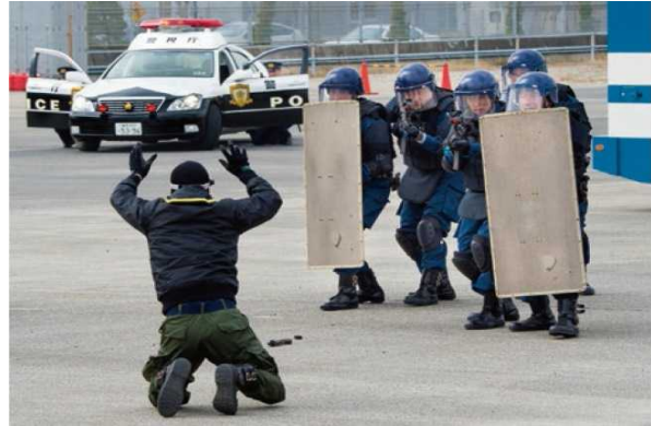
Joint training for airport counterterrorism measures

airports and seaports, are taking the lead in conducting drills simulating specific cases and in improving the protection of important facilities in cooperation with related organizations.