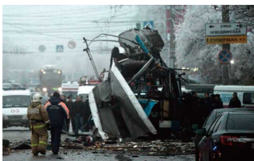
The trolleybus wreckage caused by the suicide bombing in Volgograd, Russia

members were assaulted. Also, during the 1996 Summer Olympics in Atlanta, U.S., a terrorist bombing occurred at the Central Olympic Park. Additionally, in recent years, a terrorist bombing attack targeting London's subway system took place in July 2005 during the G8 Summit in Gleneagles, the United Kingdom, killing 56 people. Also, in April 2013, a terrorist bombing attack took place a short distance from the finish line of the Boston Marathon, killing three people. Furthermore, in Volgograd, a city located about 680 kilometers northeast of Sochi, Russia, which was preparing for the 2014 Winter Olympic Games, three suicide bombings took place between October and December 2013, in which a total of 40 people were killed. Terrorist attacks targeting large-scale events have claimed the lives of many people in various parts of the world in recent years.