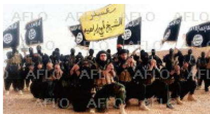
ISIL Combatants (Afro)

There are terrorist attacks conducted by radicalized individuals who have no connection with terrorist organizations (lone-wolf terrorists) in Western countries. Among them are the serial terror attacks that occurred in Denmark in February 2015. Propaganda disseminated by terrorist organizations like ISIL and Al Qaeda-related organizations through media and the Internet has radicalizing effects on these lone actors who are inclined to carry out attacks.