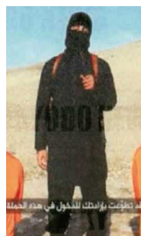
An ISIL combatant, warning of the Japanese nationals' execution

Under these circumstances, two Japanese nationals were killed in Syria in January and February 2015, which deeply shocked Japan and the world. On February 1, 2015, a video featuring these murders was released allegedly by ISIL on the Internet. This video, addressed to the Japanese government, contains messages which suggest that ISIL would continue to target Japanese nationals. Considering the current situation, terrorist threats against Japan have become reality.