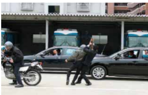
Training Status of Protective Measures