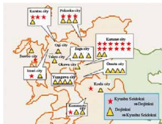
Incidence of unlawful acts attributable to the turf war between the Dojinkai and the Kyushu Seidokai (2006-2012)

There were 13 unlawful acts attributable to this turf war in 2011 and 7 in 2012. These include incidents involving the discharge of firearms in residential areas, causing great anxiety among citizens.