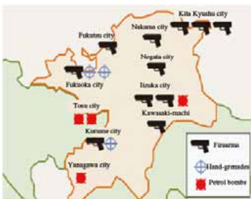
Incidence of attacks on businesses, etc. involving the use of firearms, etc. in northern Kyushu (2011, 2012)

Case: In January 2012, in a residential area with an elementary school and a nursery school in the immediate vicinity, a gang boss (38) and associates affiliated with the Kudokai opened fire upon a construction company president, causing penetration injuries to his abdomen and right arm, requiring three months to full recovery. In December of the same year, this gang boss and associates were arrested under charges of attempted murder, etc. (Fukuoka)