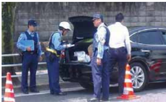
Checkpoint activities in Kita-Kyushu city, Fukuoka prefecture