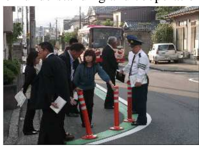
Members of Police Station Council inspecting a widened roadside pedestrian belt

2013 welcomed the 40<sup>th</sup> anniversary of the commencement of the relationship between Japan and ASEAN, and senior officers of the NPA attended the 33<sup>rd</sup> ASEANAPOL Conference (conference of ASEAN Police Chiefs) to exchange views and strengthen cooperative ties.