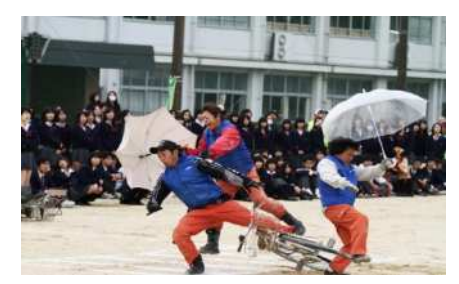
Stuntmen re-enacting an accident

Through coordination with schools and other institutions, the police are promoting bicycle safety education for children and students, endeavouring to provide enriched educational content including accident re-enactment with bicycle stuntmen and classes involving participation, hands-on experience, and practice using bicycle simulators. During 2011, about 30,000 bicycle classes were held across Japan for children, students, the elderly, etc. which were attended by about 4.4 million persons. In addition, police are endeavouring to implement education from the perspective of motor vehicle drivers, covering points for consideration in order to secure bicycle safety, etc. by making use of every driver education opportunity, such as courses during license renewal.