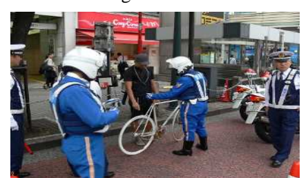
Police officers enforcing regulations regarding bicycles with faulty brakes

Focusing on priority areas and routes <sup>7</sup> for bicycle guidance education, police are reinforcing guidance and warning activities against violations such as riding with no lights, two persons on a single seat bicycle, ignoring traffic lights, and failing to stop at stop signs, and also taking strict steps including enforcement of regulations such as the issuance of traffic tickets against persons riding bicycles with faulty brakes (no brakes, etc.) and other malicious or dangerous traffic violations that have resulted in specific damage or injury to other vehicles or pedestrians or that have repeatedly violated the rules and ignored previous guidance and warnings.