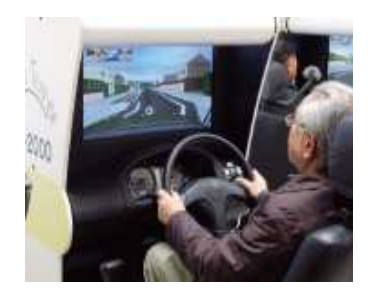
Senior driver training with driving aptitude test equipment

Police are committed to enriching education for drivers when they apply for driver's licenses and after acquiring their license. The chances for driver's education are systematically placed during the driver's license distribution process and at different stages afterwards. Police are also working to enhance measures for elderly drivers by having them complete pre-training exams (cognitive testing) and basing senior driver training on the results.