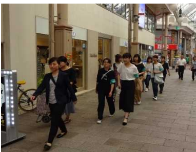
A scene of street guidance

The police, in cooperation with community juvenile police volunteers, are making every effort to detect juvenile delinquents at early stages and provide guidance in a timely manner through on-the-spot protection and street guidance activities in crime-prone areas like entertainment districts and arcades.