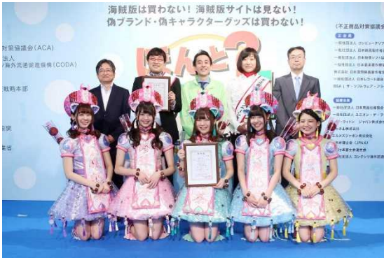
IPRs protection campaign in Akihabara

Violation of Intellectual Property Rights (IPRs) continues to be an issue. Examples of IPR violation include distribution of illegally copied business software and music data over the internet using file exchange software, and transactions of counterfeit products on websites. Counterfeit products are mostly smuggled from China and other Asian countries.