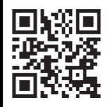
Chapter 1: Risks and Case Studies

Educational videos introducing the prevention of unwanted technology transfer