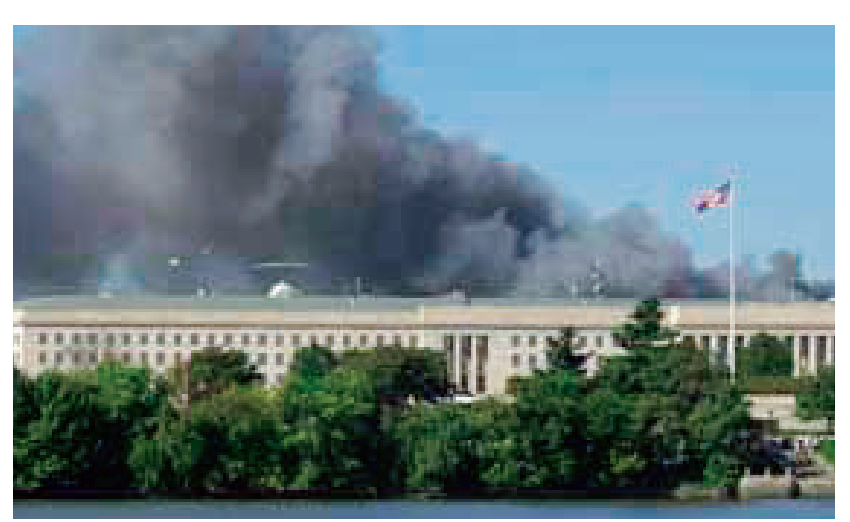
Black smoke rising from the Pentagon (September 2001)

In the same month, the director of the Federal Bureau of Investigation (FBI) announced that Usama bin Ladin