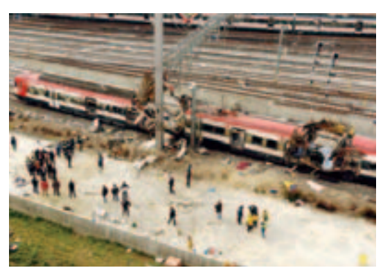
Simultaneous train bomb attacks in Madrid, Spain (March 2004)

In the United Kingdom, four simultaneous bomb attacks on train cars and a bus occurred in central London in July 2005 when the G8 Summit was being held in Gleneagles. This resulted in the deaths of 56 people and left approximately 700 people injured. A similar terrorist attack occurred two weeks later in London, this time resulting in no deaths or injuries. Many countries were shocked to learn that the perpetrators of these terrorist attacks were youths living in major European countries who had become extremists.