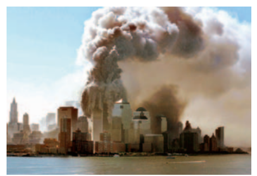
The World Trade Center and other high-rise buildings in Manhattan consumed by flame (September 2001)

"Al-Qaeda" continued to expand its influence in not only its main activity bases like Afghanistan, but also in the former republics of the Soviet Union, Central Asia, and Southeast Asia, committing a series of terrorists acts, even killing private civilians. In October 2000, it was suspected of being responsible for driving a bomb-laden boat into the US Navy destroyer "Cole" which was