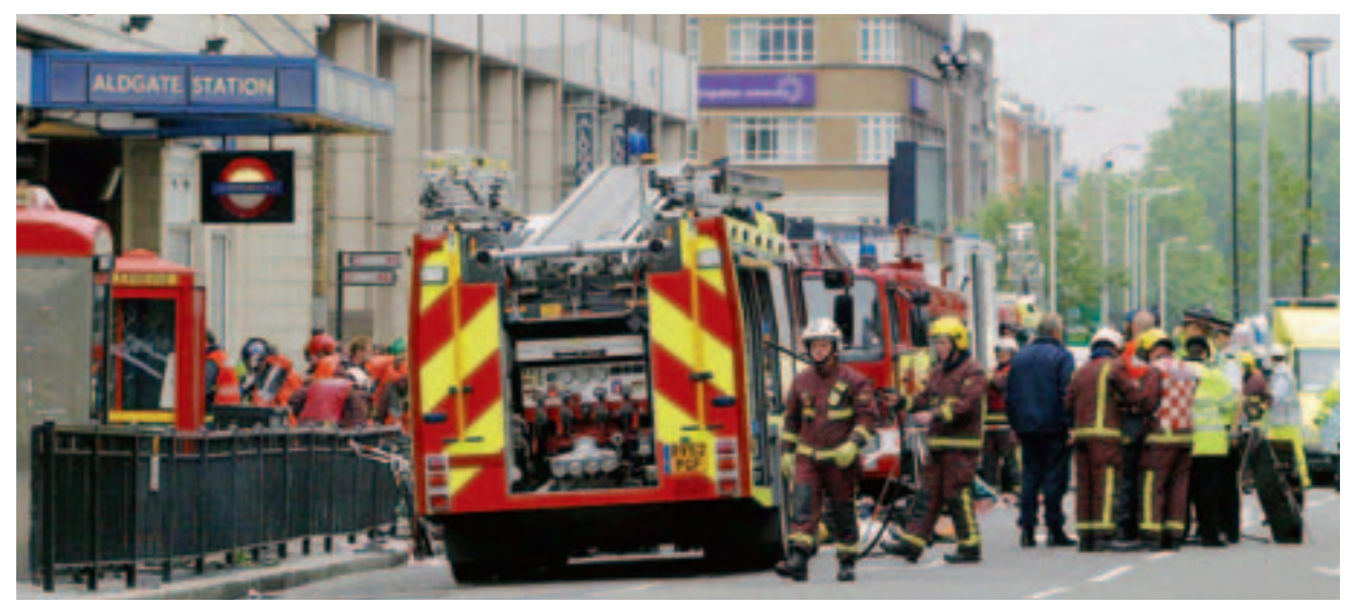
Simultaneous terrorist attacks in London, United Kingdom (July 2005)