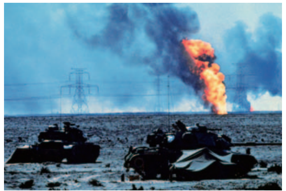
The Gulf War (January 1991)

Because this religious edict made terrorism against US interests a religious obligation, it is seen in effect as a declaration of war against the United States.