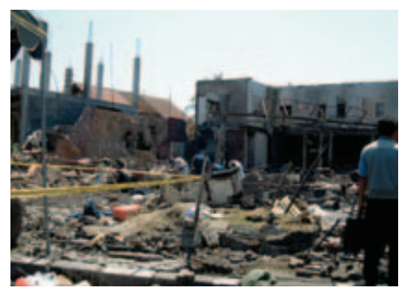
Terrorist bomb attacks in Bali, Indonesia (October 2002)

A bar and a disco in Bali, Indonesia were bombed consecutively, claiming the lives of 202 people (including two Japanese nationals) and injuring over 300 others, with the majority of the victims being Australians and other foreign tourists. Indonesian authorities arrested the suspects, including the principal suspect, and announced that "Jemaah Islamiya" was involved in this crime.