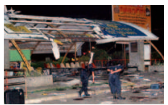
Terrorist bomb incident at the Davao international airport in Mindanao island (March 2003)

The "Moro Islamic Liberation Front", which holds influence on the Philippine's southern part of Mindanao, had been engaged in furious battles with the Philippine government. However, "Moro Islamic Liberation Front" and the Philippine government signed a cease-fire agreement in July 2003 and peace talks are currently advancing. However, some factions of "Moro Islamic Liberation Front" opposing to the peace talks are believed to still be actively committing terrorism in the country through collaborations with other Islamic extremist groups.